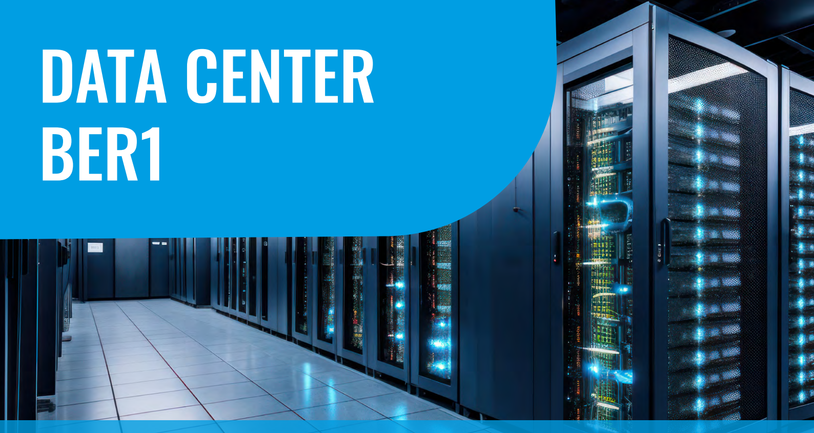
ITENOS stands for more than 30 years of ICT experience. We put our faith exclusively in state-of-the-art technologies, so we always deliver the best solution.